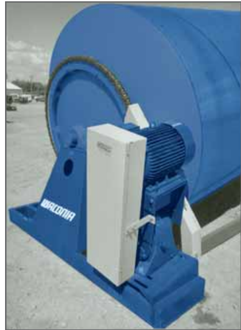
A Waconia Rotary Blender is marked by a cleaner, more professional, finished design. Heavy duty blender drive motors are totally enclosed, fan cooled and located in a higher relatively dust-free environment.

Large 3-1/2" tri-rollers provide less conveyor belt resistance which requires less horsepower and makes for less wear.