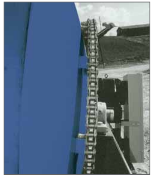
Drum drive sprocket features bolted construction for quick and easy replacement in the field.