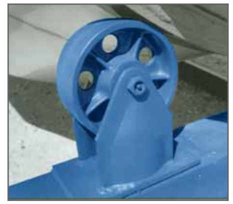
Another example of Waconia leadership is our crowned trunion wheel that distributes weight evenly across the loaded surface for longer life and less wear. Enclosed trunion wheel is easily greased, even with guard in place. (Guard removed for photo)